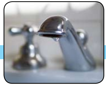
Better in the bathroom.